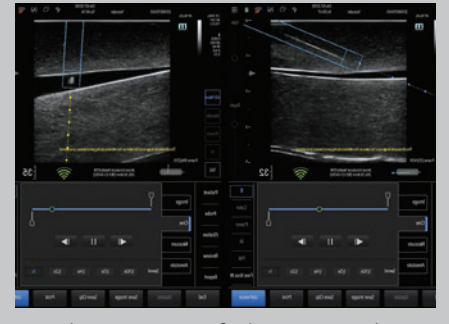
In-plane vs. out-of-plane procedures