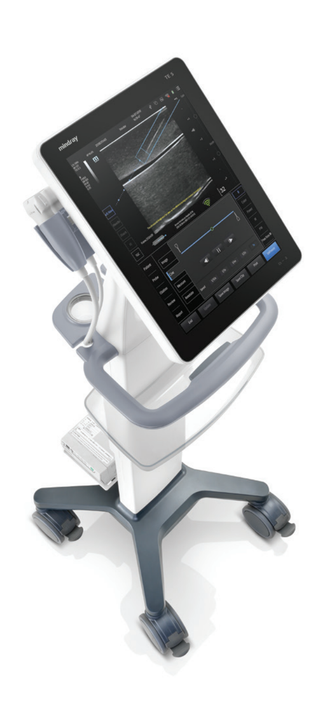
TE5 Ultrasound System