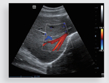
Color Flow of Liver

With powerful user-defined presets, auto image optimization, iWorks (scan protocol), and patient information management system, the Z60 Ultrasound System makes it fast and easy to complete exams. The System also provides onboard reporting and DICOM 3.0 which greatly improves your workflow without compromising diagnostic accuracy.