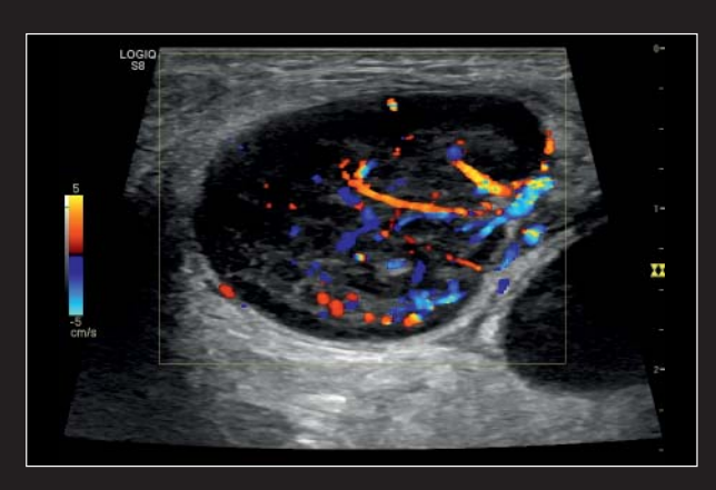
Outstanding color flow sensitivity in the small vessels of this abnormal lymph node