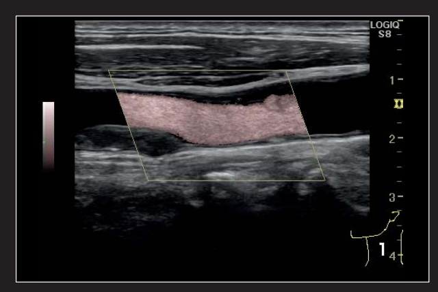
B-Flow Color showing flow hemodynamic within a diseased Carotid Artery