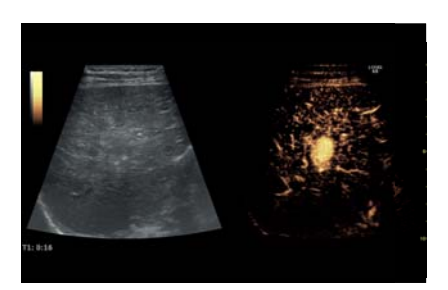
Dual imaging of a liver lesion in arterial phase

A full suite of settings to achieve superb contrast agent resolution, sensitivity and penetration in a variety of clinical applications.