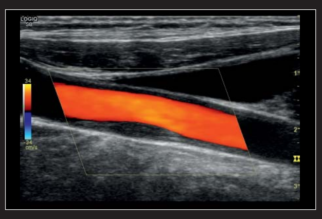
Colorized arterial flow frames a common carotid artery plaque while maintaining superb B-mode image quality