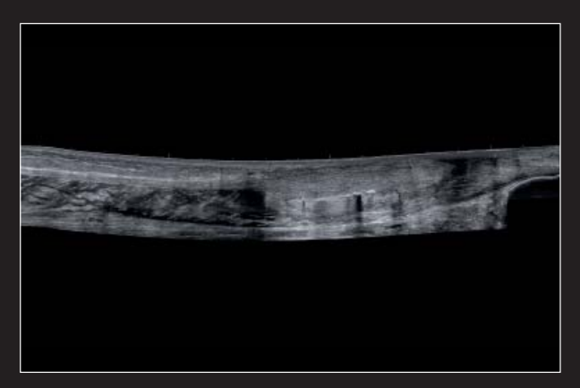
LOGIQView of Achilles Tendon repair