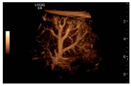
B Flow of the spleen vasculature

The B-Flow Mode, based on the GE exclusive coded technology, displays true flow hemodynamics without the limitations of Doppler, improving your clinical confidence in vascular assessment.