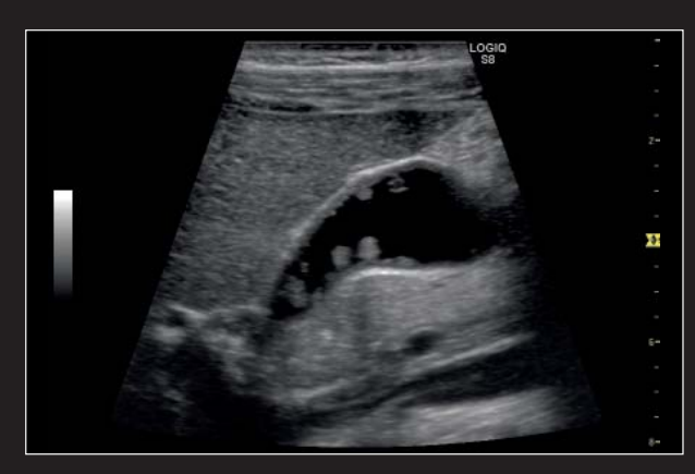
Spectacular resolution of gall bladder polyps